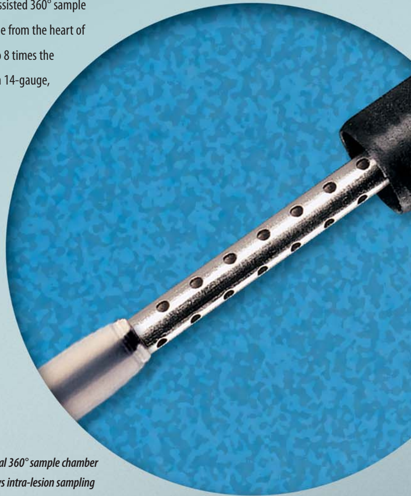
Virtual 360° sample chamber allows intra-lesion sampling

When you consider technology, performance and price, no other system comes close. EnCor 360 is today's new standard for simple, improved, more cost-effective ultrasound biopsy.