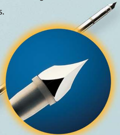
Tri-Concave™ Trocar Tip

EnCor 360 offers the patented Tri-Concave™ trocar tip, considered to be one of the sharpest cutting tips in the industry. Pre-programmed half sample option is available without changing the probe—ideal for thin breasts and lesions in tight locations.