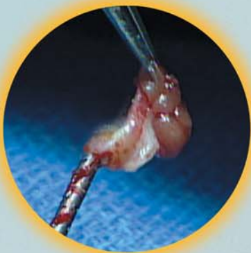
Easy sample removal