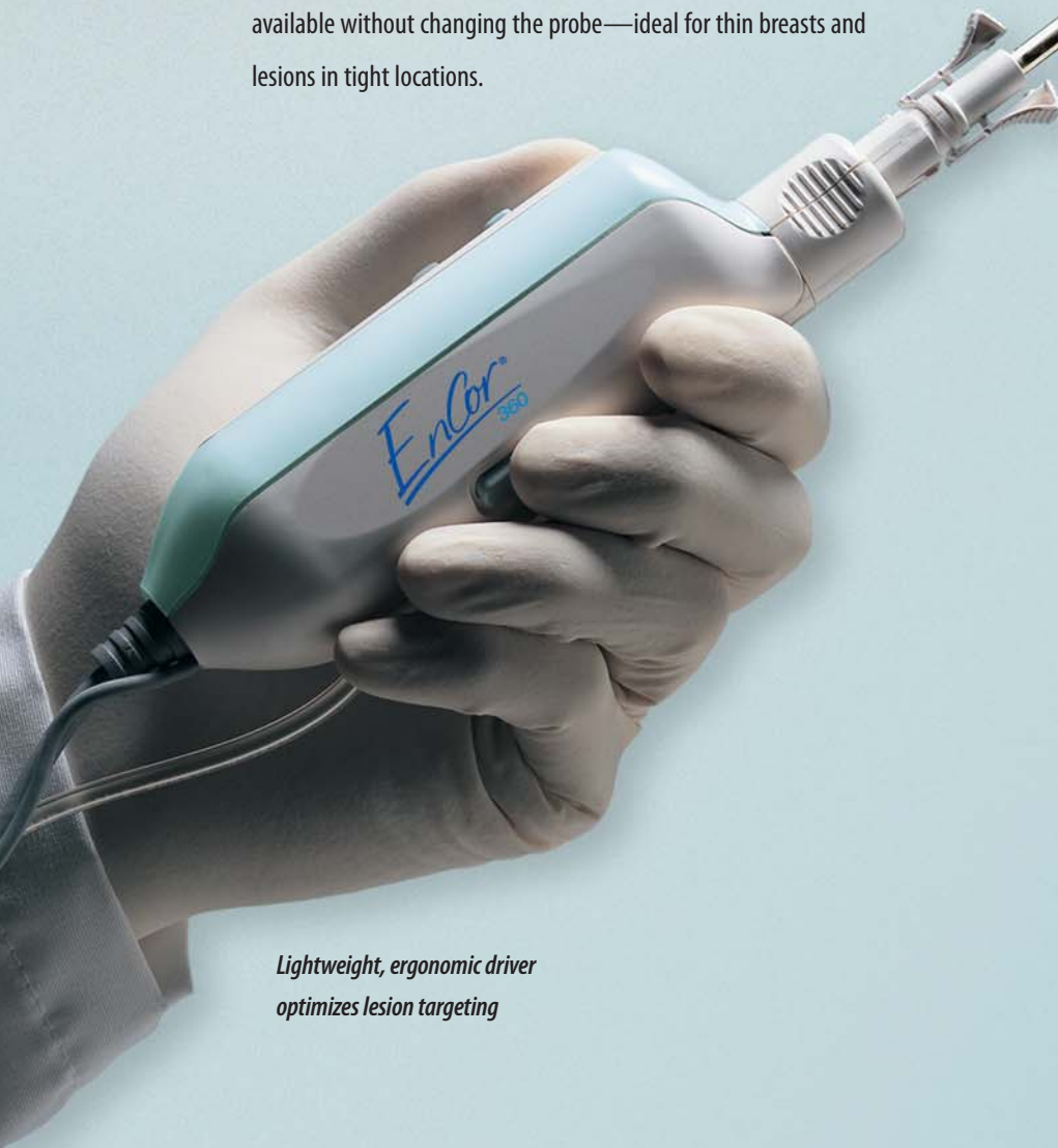
Lightweight, ergonomic driver optimizes lesion targeting