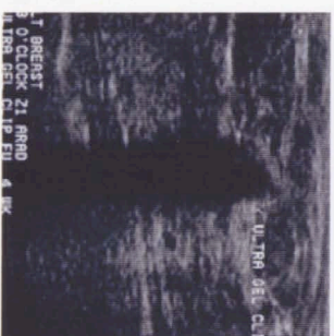
Ultrasound picture demonstrating the posterior shadowing produced by the reabsorbable pellets.