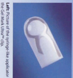
Left: Picture of the syringe-like applicator of the Gel Mark Ultra™ clip.