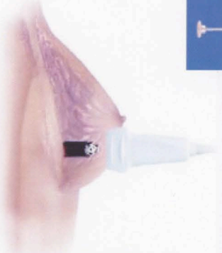
Picture demonstrating proper placement of ultrasound probe and intraoperative localization of the biopsy site.